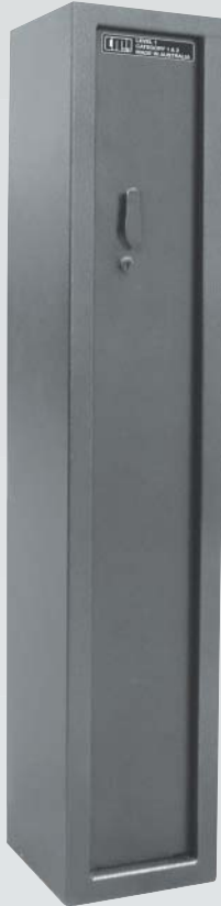
MODEL SDS-1 HOLDS 1 TO 4 GUNS