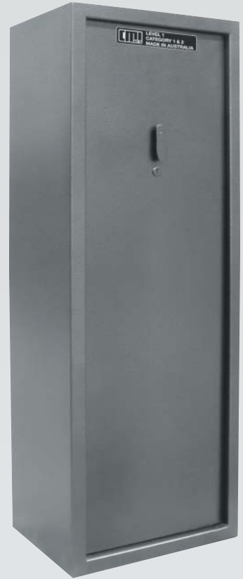
MODEL SDS-3 HOLDS 1 TO 8 GUNS