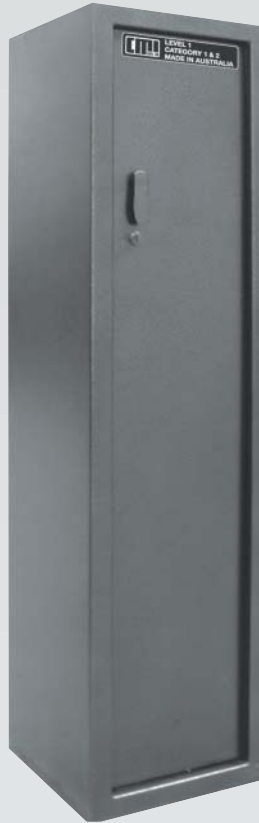
MODEL SDS-2 HOLDS 1 TO 6 GUNS