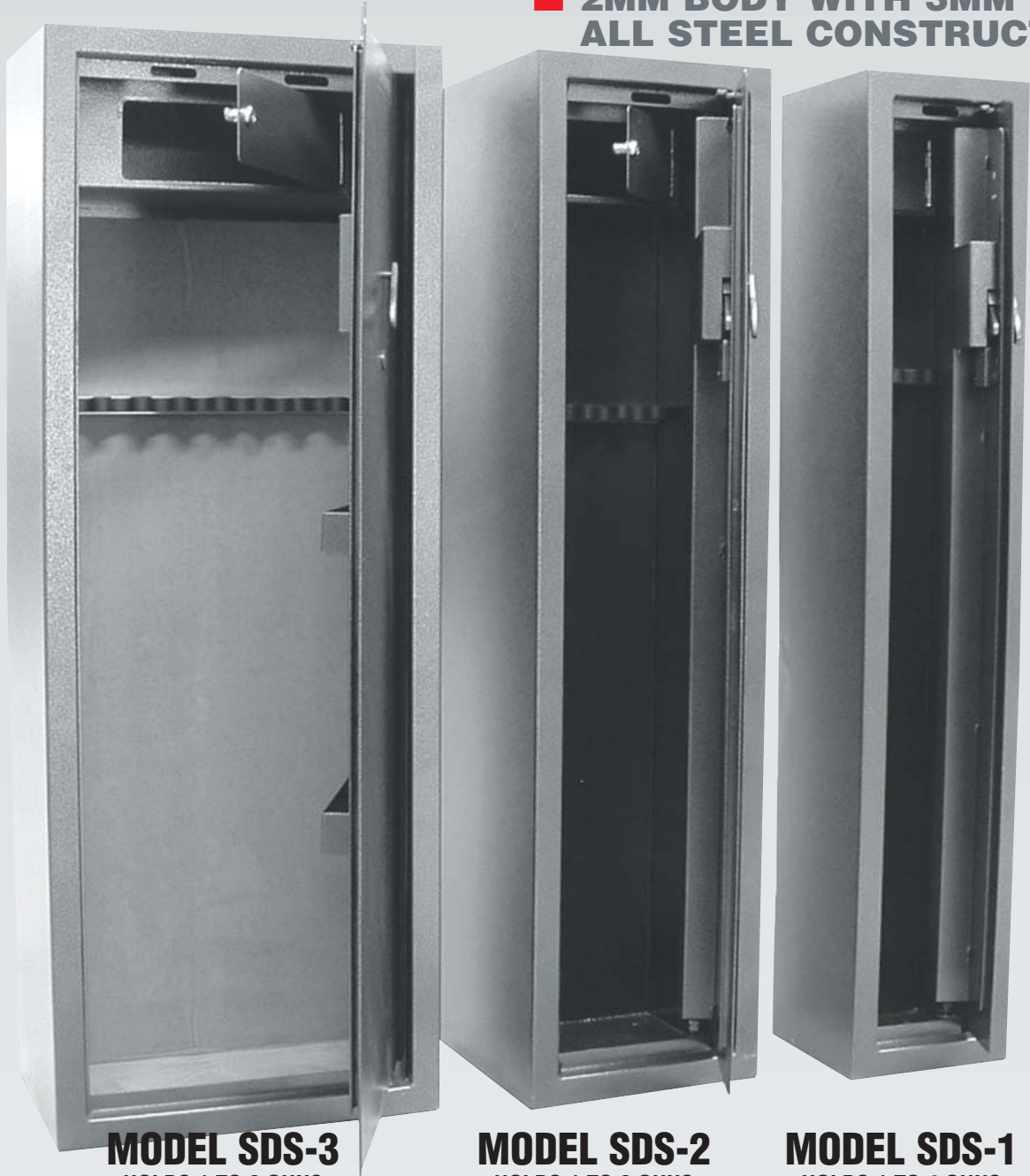
MODEL SDS-3 HOLDS 1 TO 8 GUNS