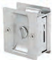
Flush Pull / Lock