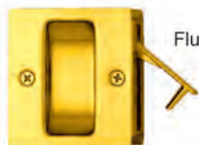
Flush Pull / Latch