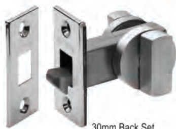
30mm Back Set